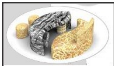
Figure 4. Taiji diagram

Fit form: A conjunction form is what we often said the positive shape and the negative shape, people normally used common elements to connect two or more forms. They are both independent and correlated, presenting people with a lot of fun. Taiji diagram and childhood toy jigsaw puzzles are both representatives of fit forms that we are familiar with (refer with: Figure 4).