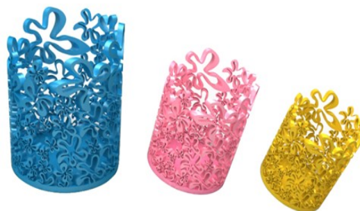
Figure 6. Color design

Carolyn Bloomer, a visual art psychologist of American thought that: “Color can evoke people’s different kinds of emotions and feelings, and even influence our normal physiological feelings”. Indeed, reasonable and ingenious match color for products could stimulate consumers to buy, therefore making the product a all-time-winner in the market (refer with: Figure 6).