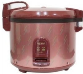
Figure 7. Man-machine design

The research of psychological ergonomics is in relation to one's psychological environment. It includes understanding, cognition, memory, reasoning and emotion. The relevant topics include communication, spiritual workload, cognition, policy, skilled performance and human-computer interaction, human reliability, working pressure, training, cultural differences, attitude, fun and exciting, etc (refer with: Figure 7).