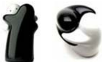
Figure 5. Seasonings container

Looking carefully, we can find that the use of correspondence of form is common in all kinds of product design. For example, the seasonings container in the figure shows two lovely cartoons embracing each other, waking endless dreams of people. At this time, this product is not only a flavoring container on the table, it is also an artwork that all people will fancy (refer with: Figure 5).