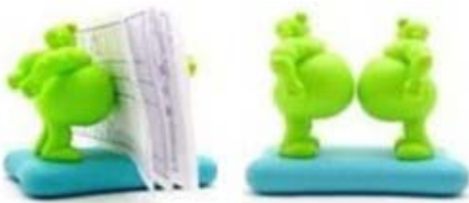
Figure 3. Typical Korean design

Coordination between product and environment: Environment here refers to the subject or to accept the design aesthetic of the main consumer, the consumer activity or activities in which the aesthetic space, including natural and social environment. Product should change with changes in the environment.